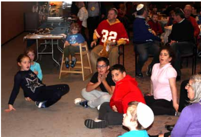
Playing Chanukah trivia