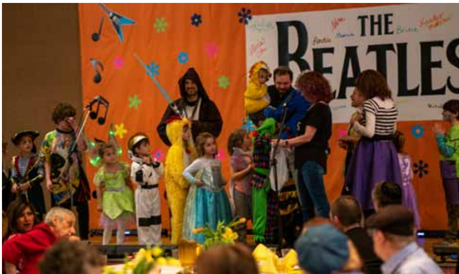
Kids' costume parade