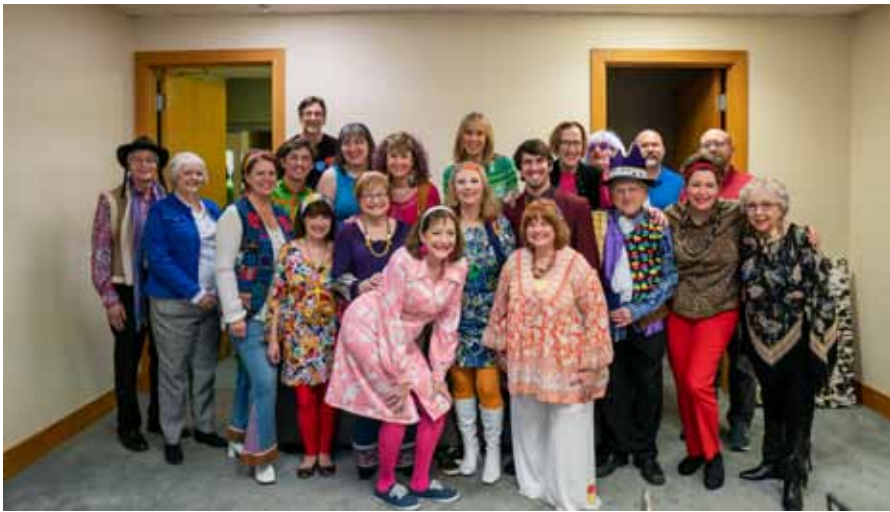
Cast and Crew