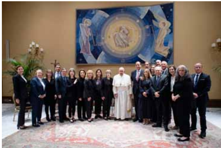
A delegation of members of the U.S. Holocaust Memorial Museum meeting with Pope Francis in October at the Vatican.