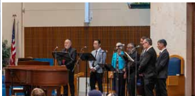
Our guest performers